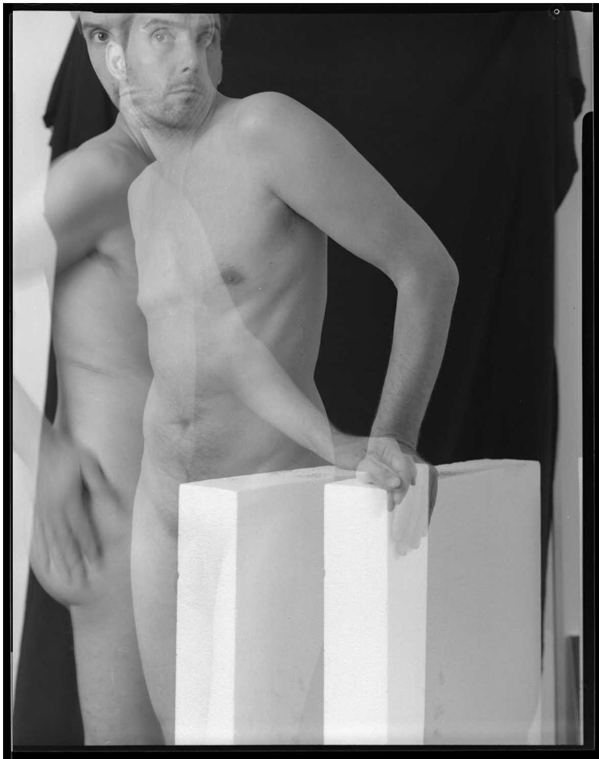
Touch , 2011-2013 (from the series Central Perspective ) silver gelatin on baryta paper